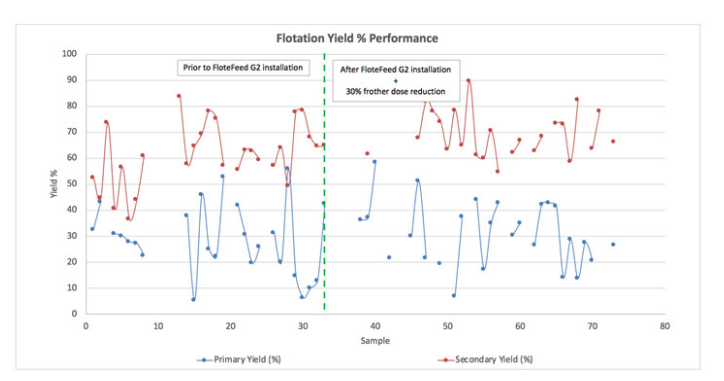
Figure 1: Flotation ash yield for three weeks before and three weeks after FloteFeed G2 installation.

Plant sampling demonstrated the following results.