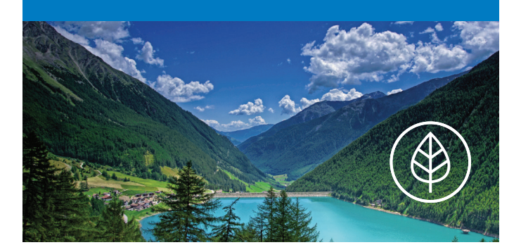
Achieve sustainability goals by minimizing your plant's carbon footprint and overall environmental impact.

Nalco Water can customize a cooling water program for you that delivers equivalent or better scale, corrosion and fouling performance at a comparable price to traditional technology while eliminating or significantly reducing the concentrations of substances of concern to you.